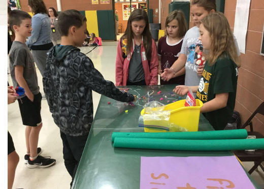
Community Service Project

Our 5th grade girls are making bracelets and selling them to students for $.50 as a community service project.